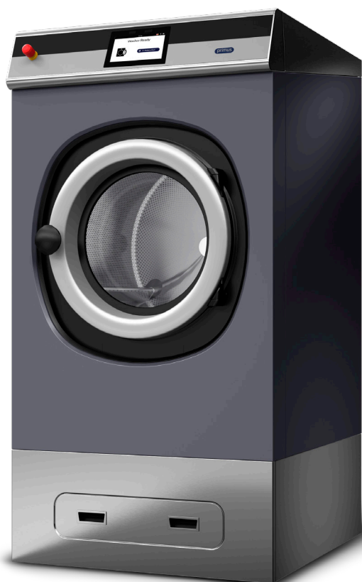
FX135 with integrated dirt collector